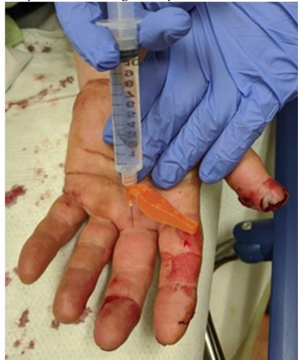
Figure 5. Digital block with 2-3cc only between the vessels.

The exception to this principle is the digital block. It is important to avoid more than 2-3 cc 1% lidocaine with 1:100,000 epinephrine buffered with 8.4% bicarbonate of tumescence between the digital bundles to avoid compression of the vessels. Inject with the needle at 90° to the skin. To achieve dorsal anesthesia proximal to the proximal phalangeal joint, a dorsal injection of 3 cc 1% lidocaine with 1:100,000 epinephrine buffered with 8.4% bicarbonate is also required. A local ring tourniquet is well tolerated.