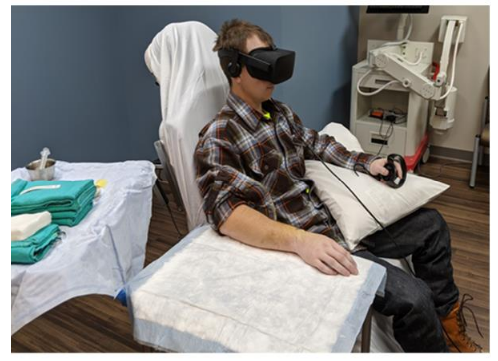
Figure 9. A patient relaxing using Wide Awake Virtual Reality (WAVR) before repair of multiple radial forearm extensor tendon and a superficial radial nerve repair.