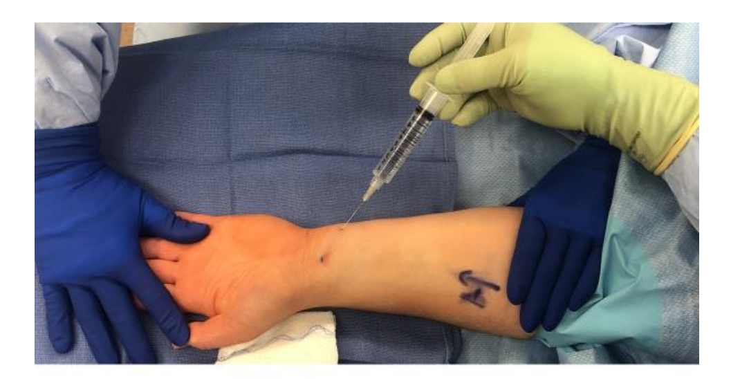
Figure 8. Ulnar nerve block.

Inject from either side of the flexor carpi ulnaris tendon 1-2 cm proximal to the pisiform. Deliver 5-10cc 1% lidocaine with 1:100,000 epinephrine buffered with 8.4% bicarbonate, taking care to aspirate to avoid intravascular injection of the ulnar artery. Deliver a further 5 cc of 1% lidocaine with 1:100,000 epinephrine buffered with 8.4% bicarbonate at the ulnar styloid dorsally to catch the dorsal branch.