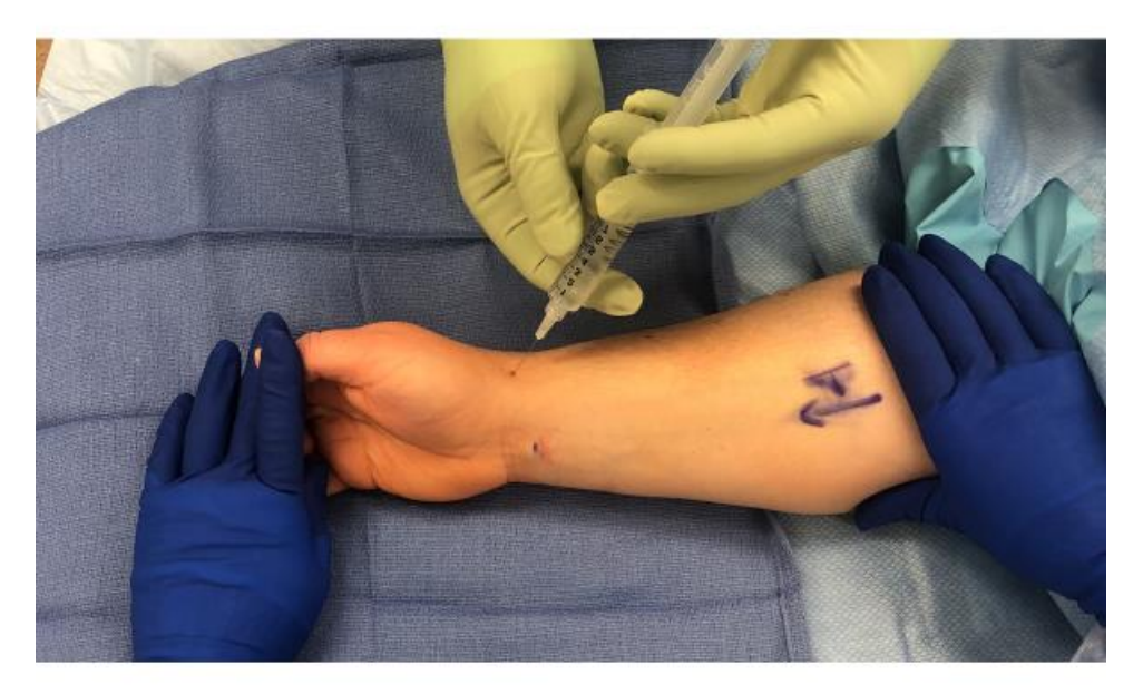
Figure 6. Superficial radial nerve block.

Injection of 5-10cc of 1% lidocaine with 1:100,000 epinephrine buffered with 8.4% bicarbonate over the radial styloid and anatomic snuffbox just beyond the divisions of the superficial radial nerve. Frequent aspiration is important to avoid accidental injection of the cephalic vein.