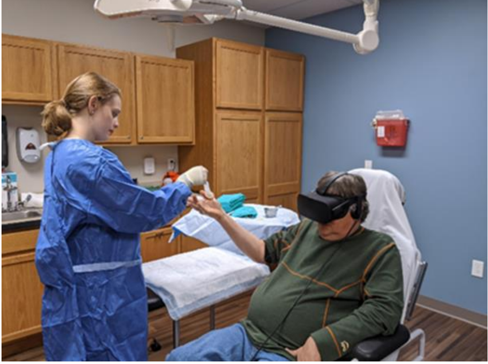
Figure 10. A patient preparing for exploration and repair of a zone 6 extensor tendon injury using WAVR.